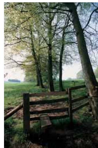
▶ (Picture 3) A footpath leads from a woodland area across open grassland.

makes it more likely that they will not go on the rest of the land. In this way much of the land is left almost undisturbed for the shy creatures to live in.