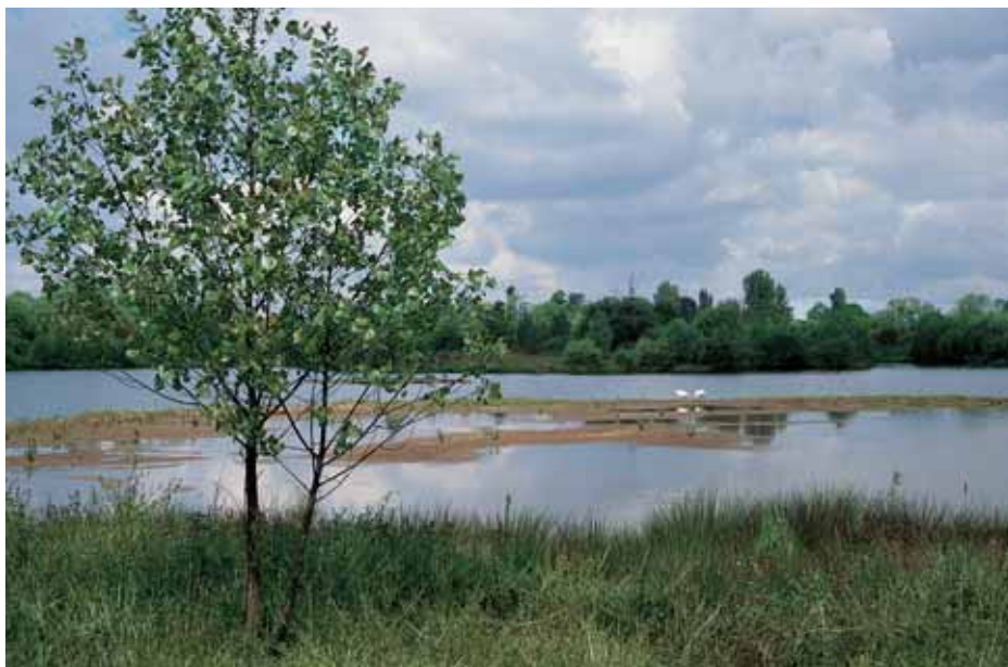
▲ (Picture 2) An artificial island has been left in this old gravel pit to make a safe home for some waterbirds.

Adding a path that goes into part of the woodland, across some open ground (Picture 3) and beside part of the pond or lake completes the simple plan. This makes it easier for people to visit, and also