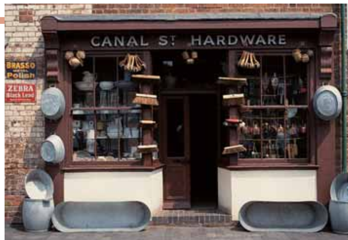
▲ Picture 3) By the Victorian Age, people were using many kinds of metal, but there were no plastics. As a result, what they sold in their shops looked very different from what we see in shops today. The objects in the shop front are baths made of a material called galvanised iron.