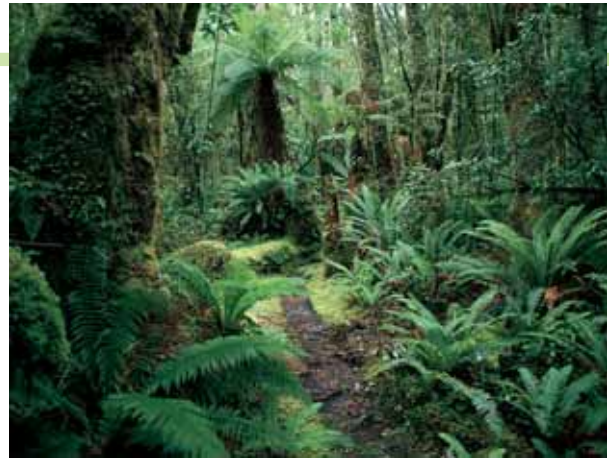
▲ (Picture 3) Some plants, such as ferns, need only a little light. If these plants were put in full sunshine their leaves would become scorched and the plant would die.