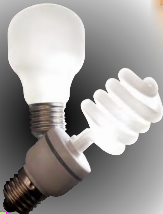
Energy-saving light bulbs.

Traditional light bulbs get hot as well as giving out light. This wastes a lot of electricity. New energy-saving light bulbs are much better.