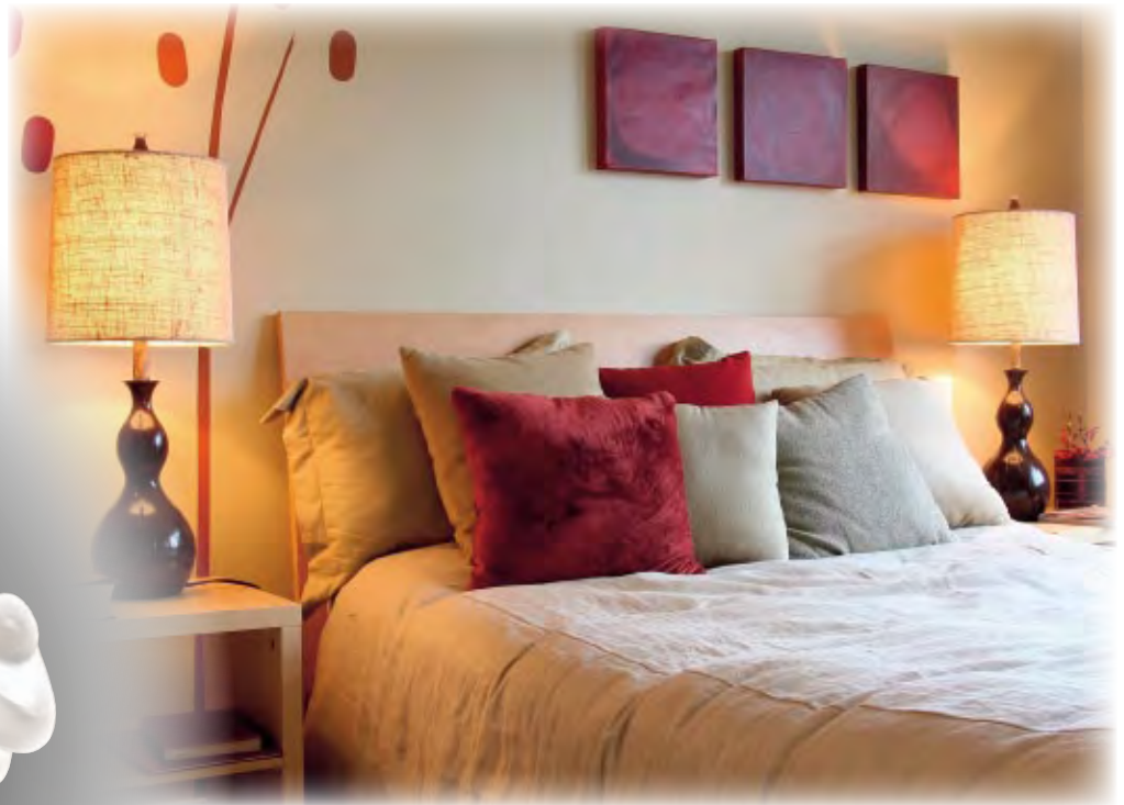
Lights are used inside homes.