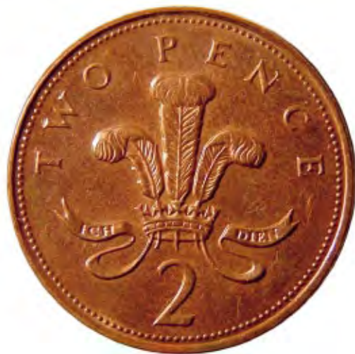
A copper coin.

A rock containing a metal in useful amounts is called an ore. The ore is heated up in a factory until the metal flows out. The metal can then be made into useful things.