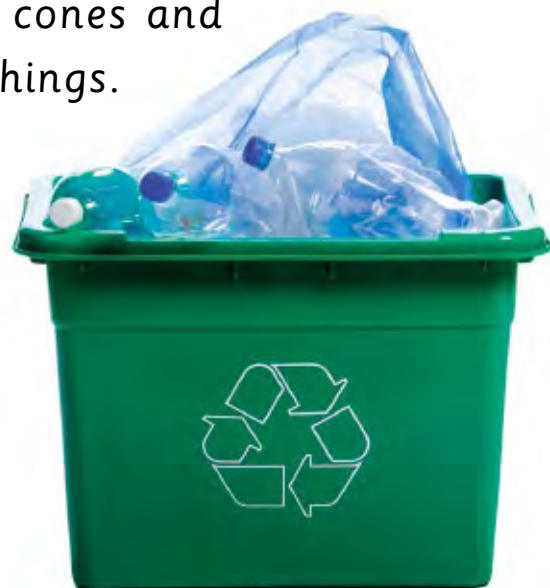
Recycle bin with plastic bag and plastic bottles