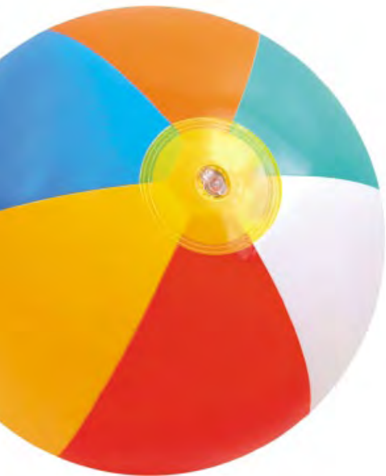
Plastic beach ball

Plastics and paper are two materials that have to be made in a factory.