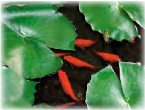
Fish swim under water lily pads (leaves).