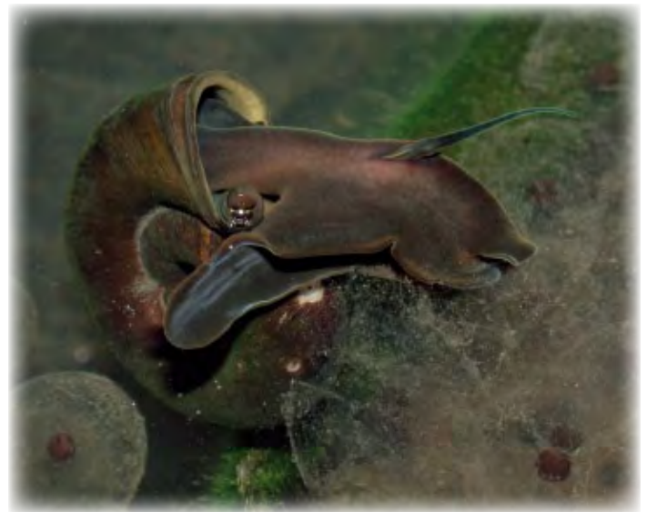
A pond snail crawls over waterweed.