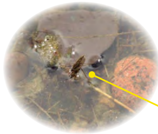
A pond skater lives on the water surface.