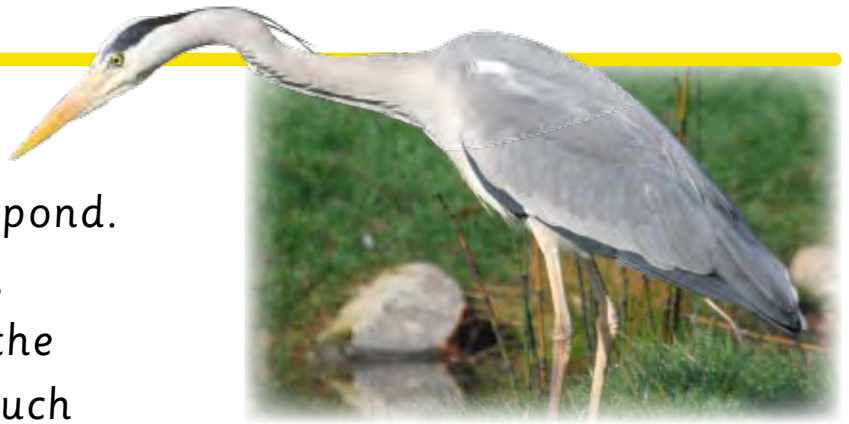
A heron waits for a fish to swim near.

Many animals live near a pond. In the pond there are fish, insects and tadpoles. On the surface there are insects such as pond skaters. Dragonflies fly about over the water. Herons look for food in the pond.