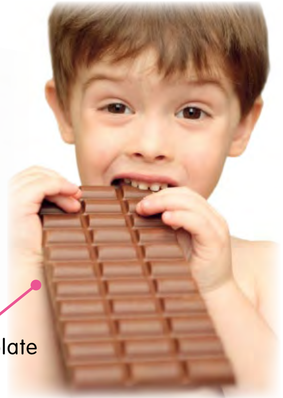
bar of chocolate

What other bendy and brittle materials can you think of?