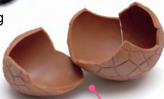
chocolate Easter egg