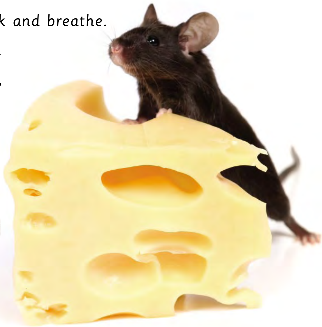
A mouse eating cheese.