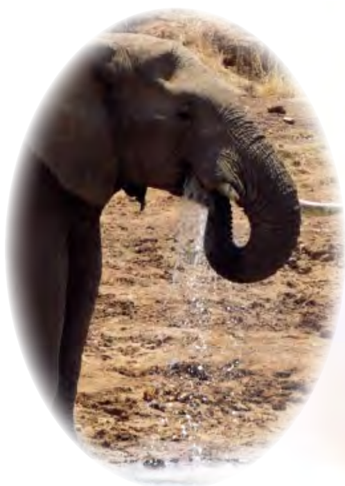
An elephant drinking.