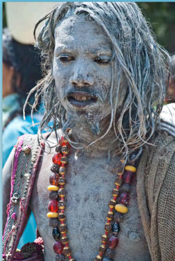
A holy man, a Sadhu, at the festival.

5 What would have happened if the demons got the potion of immortality?