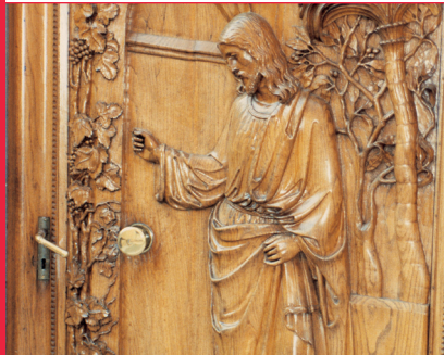
Jesus Christ (Jesus of Nazareth)