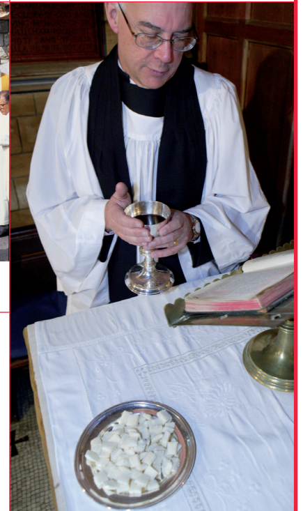
vicar or priest Holy Communion (Eucharist)