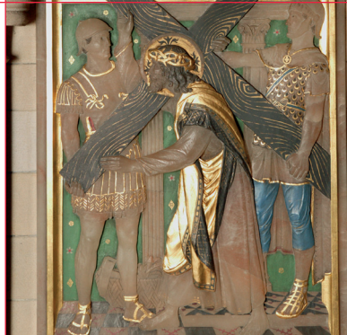
stations of the cross