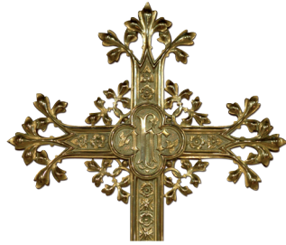
Holy Trinity: the Father, the Son and the Holy Ghost