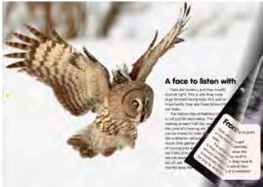
Page-turning books on a wide variety of subjects.