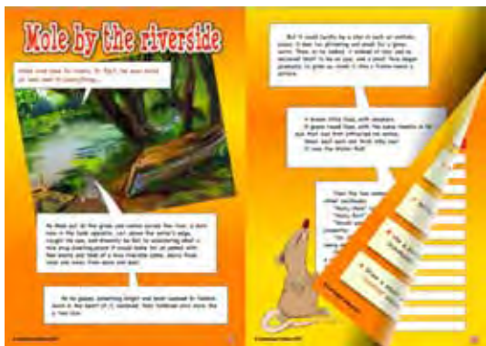
Whiteboard-friendly stories and graded questions.