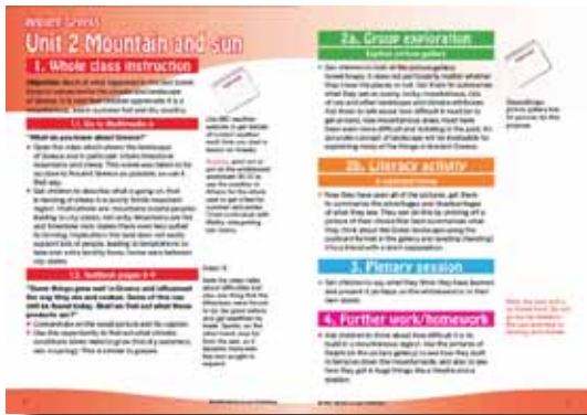
Lesson plans with objectives, varied content and outcomes.