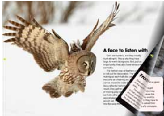
Page-turning books on a wide variety of subjects.