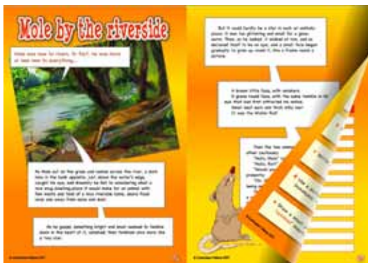
Whiteboard-friendly stories and graded questions.