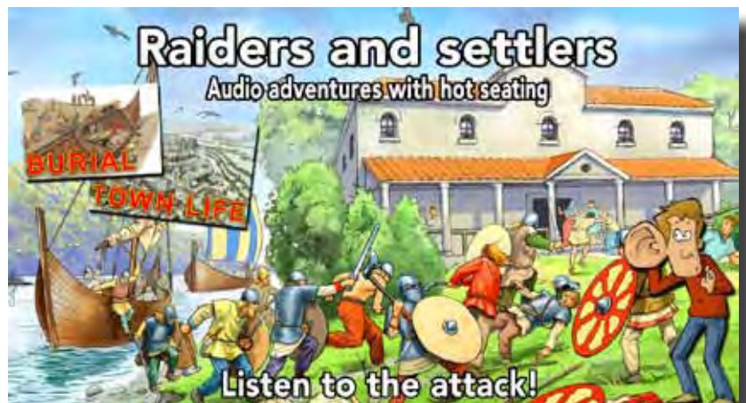
Eavesdrop audio-visual explorations... Hear what people thought!