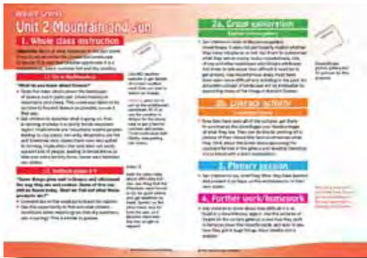
Lesson plans with objectives, varied content and outcomes.